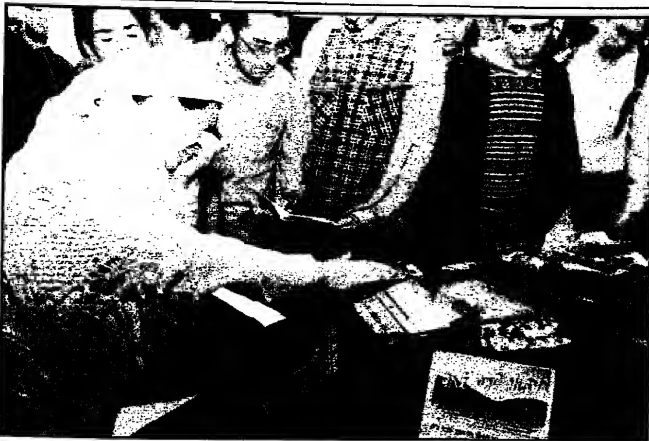
Mourners in Jerusalem yesterday file past a display of holy books that were destroyed during the battle for Joseph's Tomb in Nablus on September 26. The books were displayed in Zion Square and then, following a funeral procession that made its way through the city center, were buried in the Givat Shaul Cemetery. (Isaac Harari)

However, it will have to wait for a High Court of Justice decision on whether ministers can name associate directors-general.